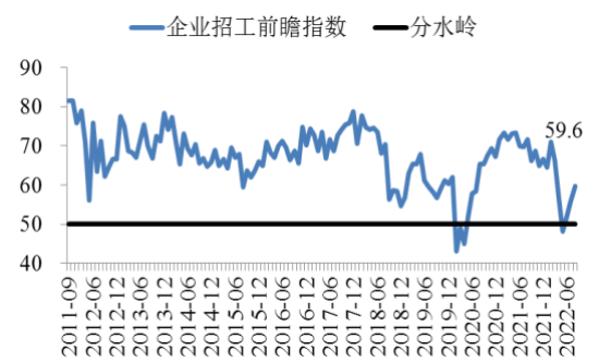
Figure 11 Recruitment Index