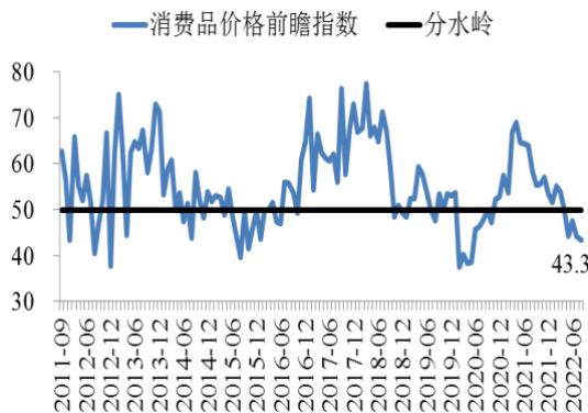
Figure 8 Consumer Price Index