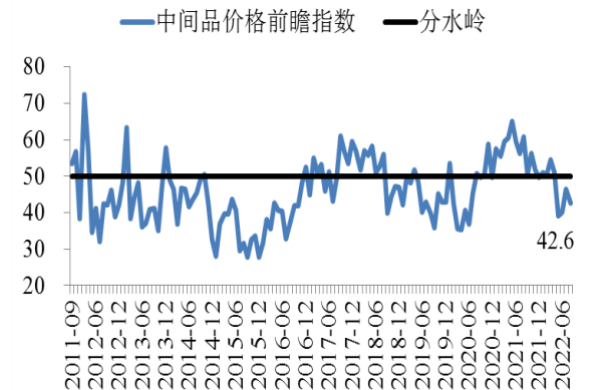
Figure 9 Producer Price Index