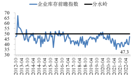
Figure 5 Inventory Index