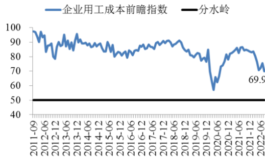
Figure 6 Labor Costs Index