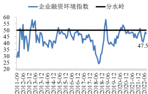
Figure 4 Corporate Financing Index