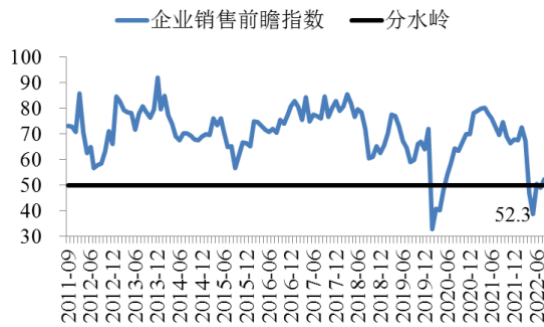
Figure 2 Corporate Sales Index

Source: CKGSB Case Center and Center for Economic Research