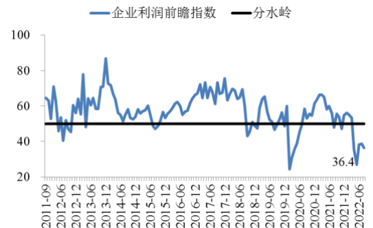
Figure 3 Corporate Profit Index