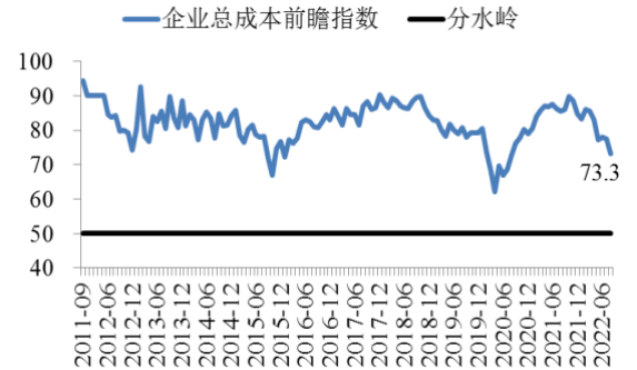
Figure 7 Overall Costs Index